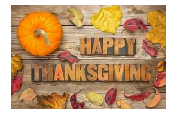
May your day be filled with love, warmth and remembrance.