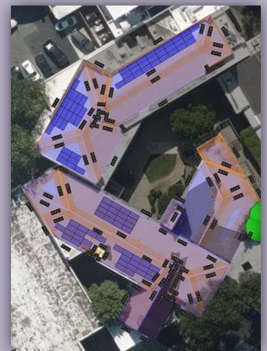
Estimated Solar Panel Locations