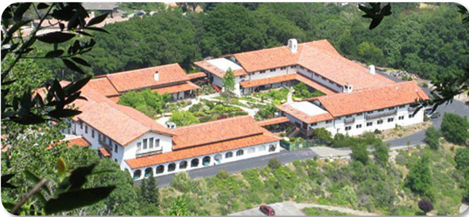
San Damiano Retreat - Danville