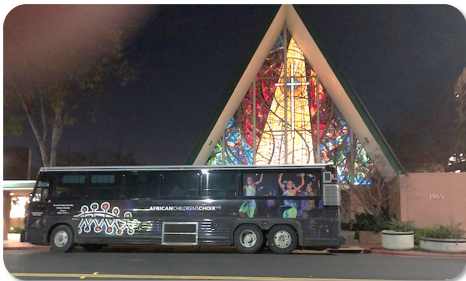
African Children's Concert Bus in Front of FPCC