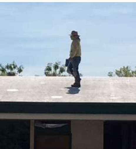
Workman repairing burn holes on upper level roof