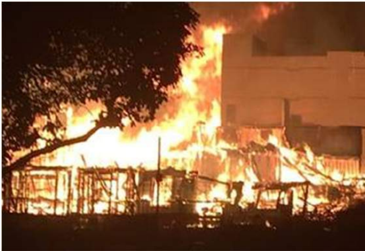
Fire at downtown apartment under construction