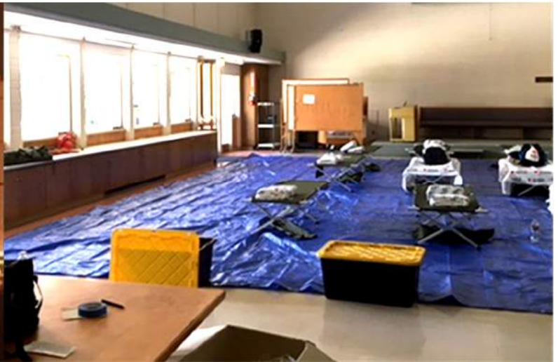
Cots set up in Fellowship Hall by Red Cross